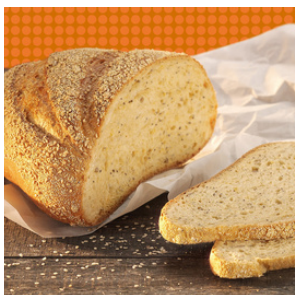
270024 Ireks Chia Bread Mix 12.5kg