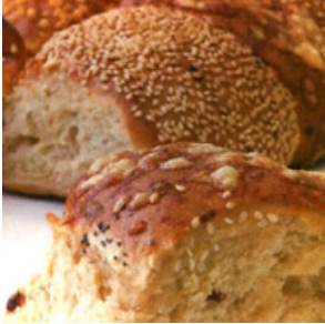
270983 Ireks Pia-Do 12.5kg