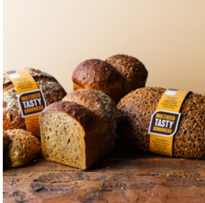
269946 Arkady Multiseed Gold 16kg