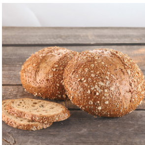
270031 Ireks Multiseed Bread Mix 12.5kg 12.5kg