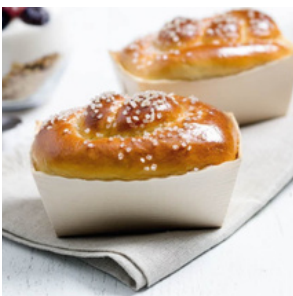
273309 Puratos Frialux 4 x 3kg 12kg