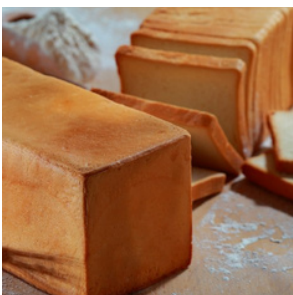
271330 Puratos Soft'R Silk 12.5kg