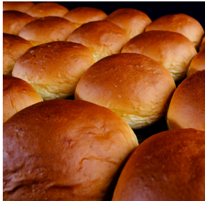
271085 Macphie Softie® 12.5kg