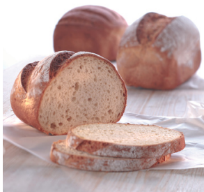
270034 Ireks Singluplus Gluten Free Bread Mix 12.5kg