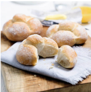
270100 Puratos S500 12.5kg