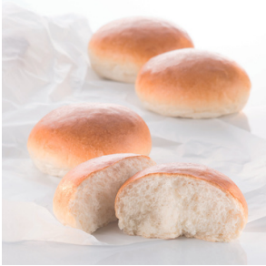
270036 Ireks Soft Roll 7 25kg