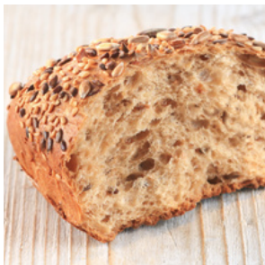
273367 Ireks Multiseed Bread Mix 25kg