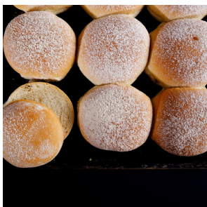
271084 Macphie Sofrol 12.5kg