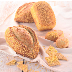
270976 Ireks Corn Bread Mix 12.5kg