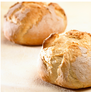
271295 Puratos S5000 12.5kg