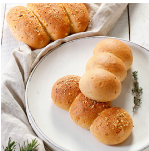
272952 Ireks Mediterranean Bread Mix 12.5kg